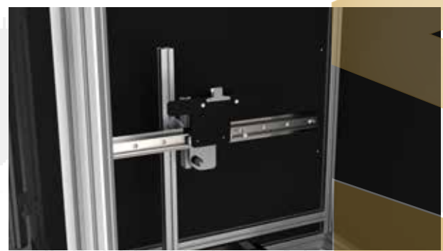
* Our products are constantly evolving. For this reason, the actual d<mark>imensions may differ.</mark> © 01/2020