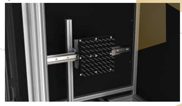
Specimen holder 4.2.2